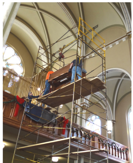
The organ is removed from the choir loft before being transported to Ohio for refurbishing.

Weekly bulletins, along with a list of current events & more, are available online at www.stjosephjoliet.org